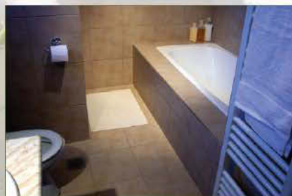
Ground floor family bathroom with 2 basins, large bath and separate shower