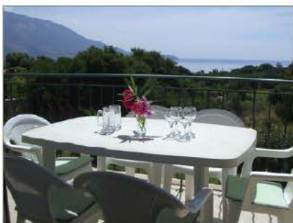
Wonderful views from the first floor balcony. Roll out awning for shade.

Good sized modern fully equipped kitchen with small breakfast bar and 2 stools.