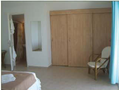
Fitted wardrobe and en-suite shower room.