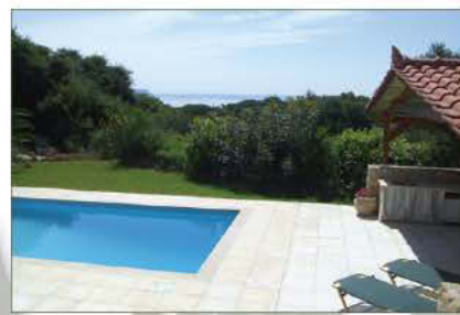
Patio with pool and pergola