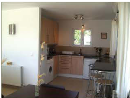
1st floor fully equipped kitchen.