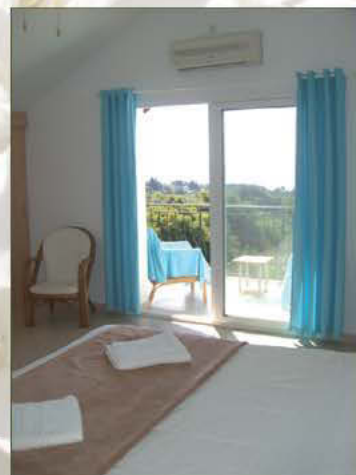
Private covered balcony with sofa, table and chairs.