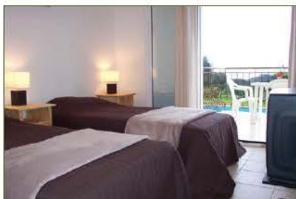
Ground floor twin bedroom