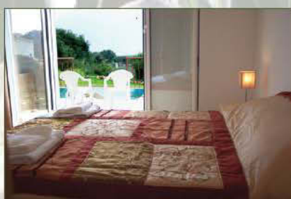
Ground floor double bedroom