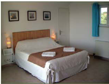
Large double bed in this spacious 2nd floor bedroom

Glass sliding doors (with mosquito net) to a private partially enclosed balcony with amazing sea and mountain views.