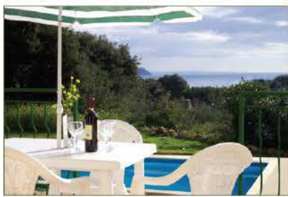
Raised patio off ground floor bedrooms

Steps from the terrace lead down to the large patio area with covered BBQ eating/sitting area and a swimming pool