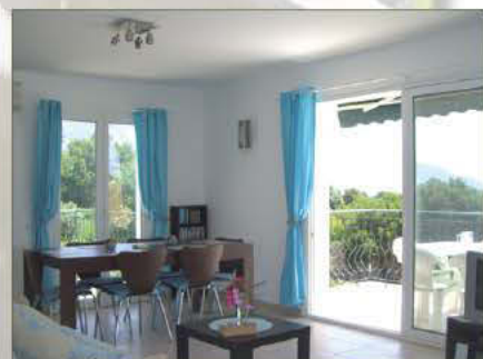
1st floor open plan lounge, kitchen, dining room with 3 balconies